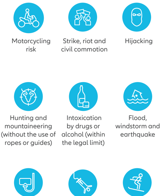
Underwater activities/scuba diving (up to 50 metres)

We understand that life may throw you a curveball. Allianz Shield Plus goes the extra mile to provide you with extended benefits to ensure your protection is assured. Subject to the terms, exclusions, provisos and conditions, the cover provided shall be extended to the circumstances provided outlined below.