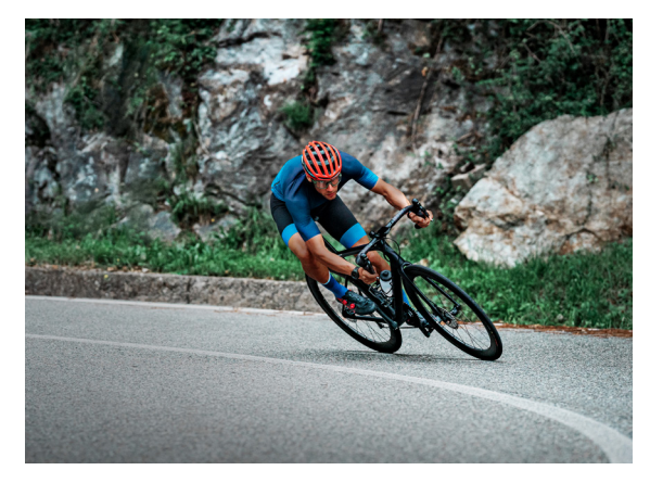
We care for health and wellbeing