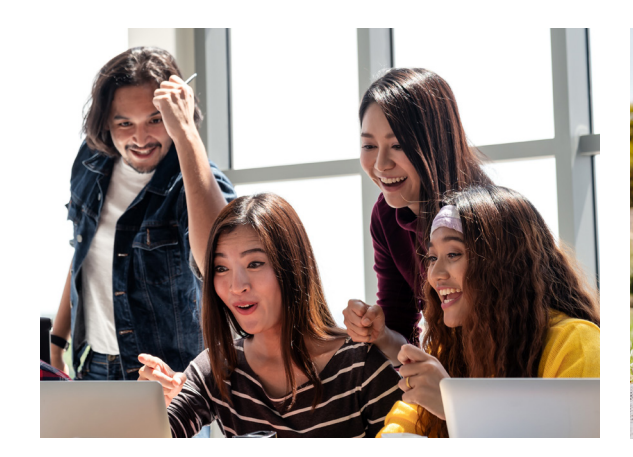
We care for inclusion and diversity

Your ambitions. Your dreams. Your challenges.