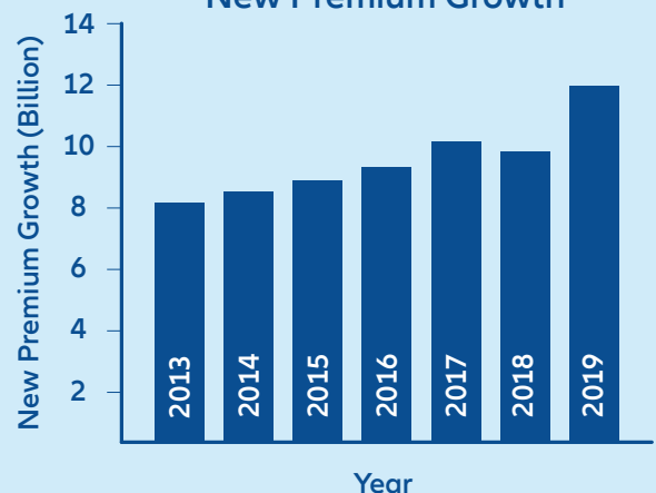
Malaysia Life Insurance Sector - New Premium Growth

[5] https://www.3age.com.my/read-this-if-you-are-not-saving-enough/