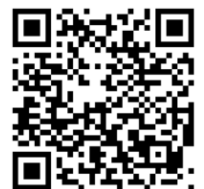
Scan QR code for FMOS' monetary limit and scope

✉ Write to: Customer Feedback Center Allianz Arena, Ground Floor Block 2A, Plaza Sentral Jalan Stesen Sentral 5 Kuala Lumpur Sentral 50470 Kuala Lumpur