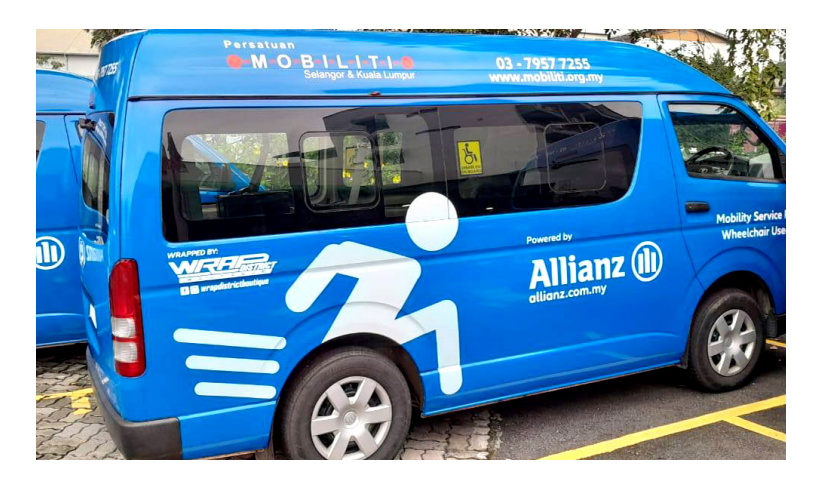
Persatuan Mobiliti Selangor dan Kuala Lumpur assisted their beneficiaries who are wheelchair users to ease their travelling with several of their vans.

Our long-term partnership with Persatuan Mobiliti Selangor dan Kuala Lumpur, a charitable organisation that provides doorto-door transportation for wheelchair users within Klang Valley through operational funding support has greatly benefited over 703 beneficiaries of Persatuan Mobiliti Selangor dan Kuala Lumpur.